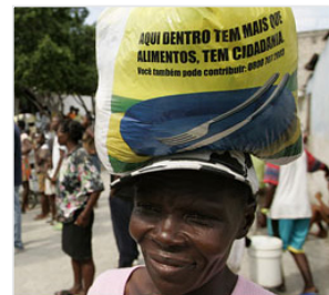
A Haitian receives food.

We have discounted tickets for the Women of Faith Conference March 12-13. Check out page 7.