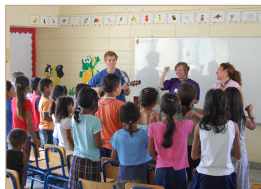
Last year youth from Gloria Dei helped with children's ministry.

He allows WGO to be his hands and feet to serve people where they need medical, optical and dental care. More than 2,500 Hondurans came to know Christ last year alone.