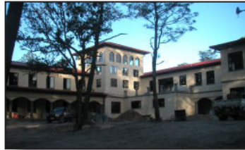
Casa de Esperanza.

Teams will reside at the newly constructed mission house, Casa de Esperanza. This comfortable setting has bedrooms, bunk beds, showers and modern restroom facilities. Both American and Honduran meals are served throughout the week. Days usually begin at 6:15 a.m. with daily team devotions.